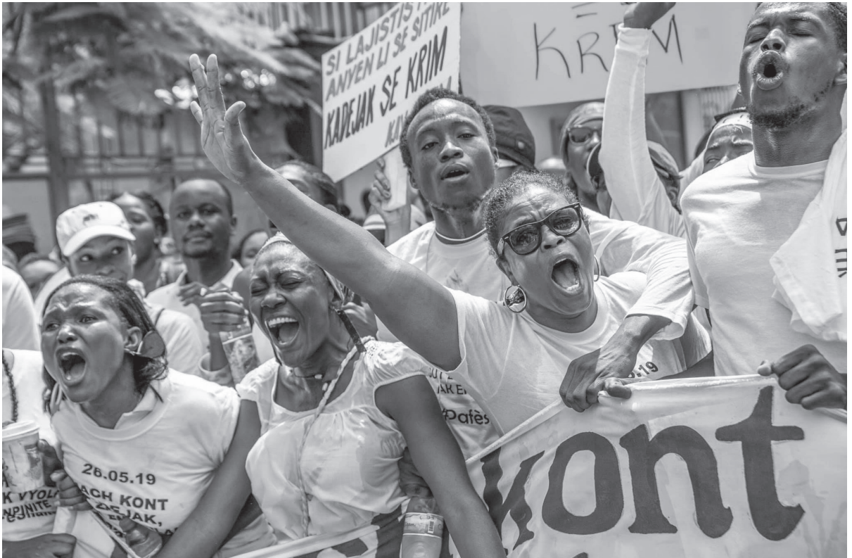
Demonstrators gather to protest rapes of university students and gender violence in Port-au-Prince, May 2019.